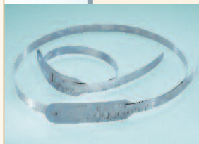
C-tape with vernier 0,05 mm top: black C-measuring tape